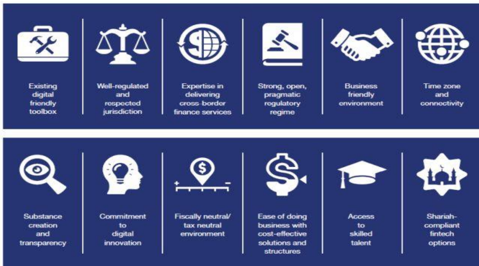
Fig. 2. Evolutionary Cycles of FinTech

The business transaction-driven with smartphones, which FinTech speed movement to massive adoption in agriculture digital market place. The investor to the customer, directly and indirectly, used the transaction of business remotely controlled through the smartphone in the digital market. The new revolution of smartphones assists in the FinTech technique become a wider impact on agriculture [22]. AgroPay model introduced with FinTech in the digital marketplace and new online platform of agriculture sustainability that connect to directly investors, landowners, farmers, and consumers based on Apps or Web allowed to communicate among all of them by smartphone with internet. Figure 2 shown below, FinTech revolution in Malaysia.